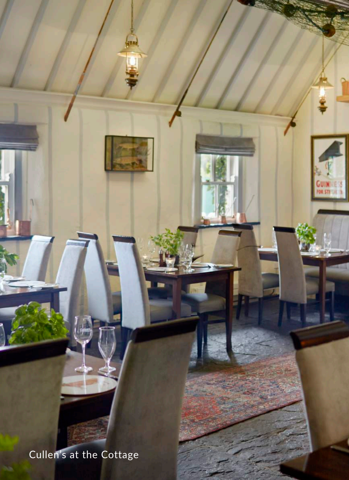
Cullen's at the Cottage