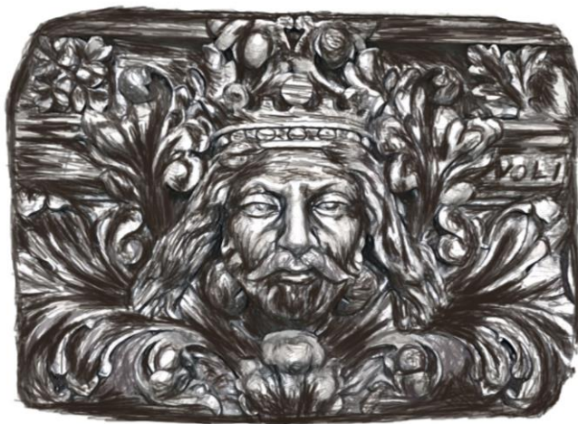
Rory O'Connor ( Ruaidrí Ua Conchobair )